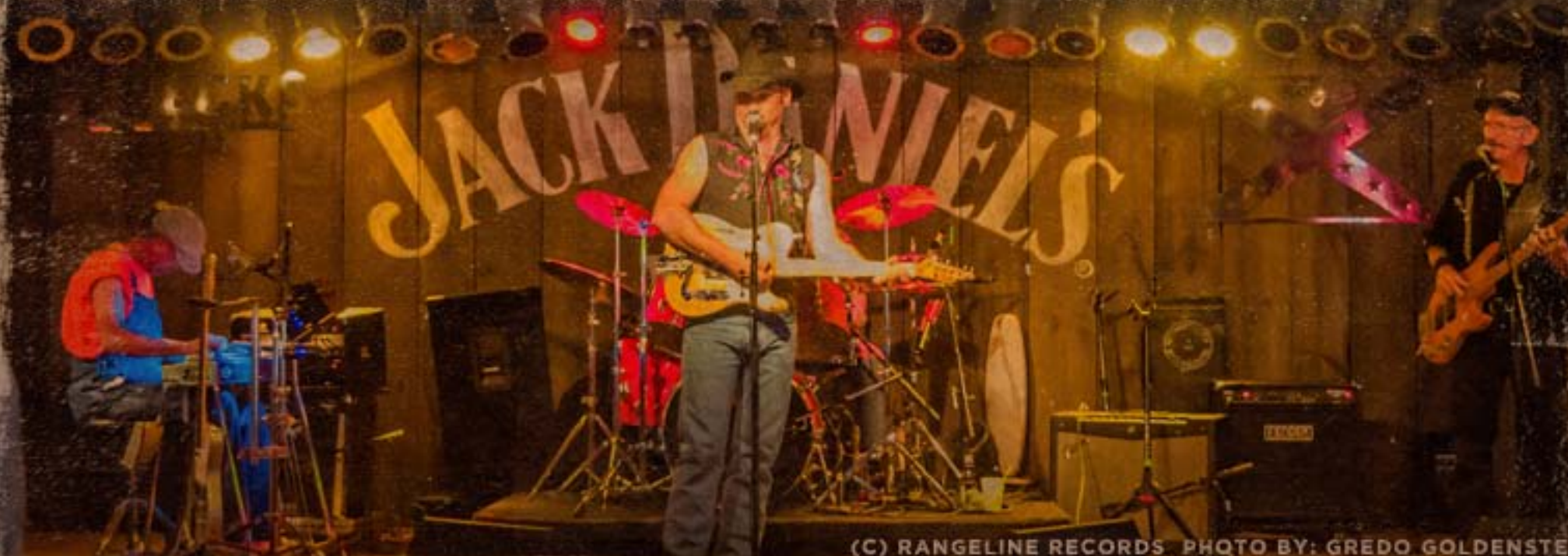
(C) RANGELINE RECORDS PHOTO BY: GREDO GOLDENSTEIN